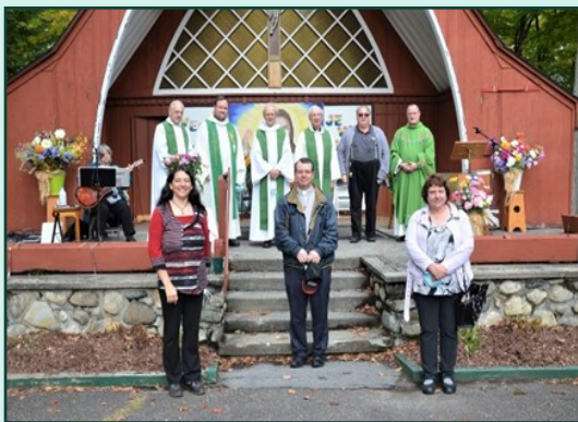
The outgoing Marist team and, in front of them, the new diocesan team

In October 1996, the Canadian Marists took under their wings the Shrine of Beauvoir (Sherbrooke) dedicated to the Sacred Heart. In October 2021, after 25 years of presence, they entrusted the Shrine to a new team of one diocesan priest and two lay women. The whole Society joins the Canadian confreres in their thanksgiving to the Lord for the work accomplished by the Marists during those years. During the official outdoor farewell celebration on 3 October, the Marists expressed their gratitude to the Sacred Heart and to the Diocese for the continuation of the care and mission of the Shrine.